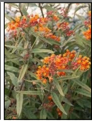
"Scarlet" Asclepias currassavica NOT NATIVE

"Silky Gold" Asclepias currassavica NOT NATIVE