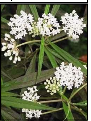
"Aquatic" Asclepias perennis NATIVE